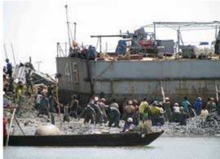
A Burmese navy ship in Hai Gyi Island damaged by cyclone Nargis. Photo taken by Mizzima after the cyclone hit the island in May.